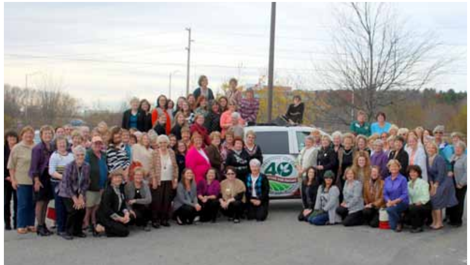
AAW's 40th Anniversary National Convention attendees celebrate the end of our year-long 40th Anniversary Drive in Portland, Maine.